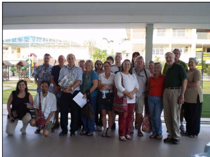
Photo: The VIS Director with the ASV Alumni

We have since been inspired to start our own alumni at VIS. We already have a number of ex VIS families who still read our newsletter so it's a start! More details of the VIS alumni will be provided at a later date.